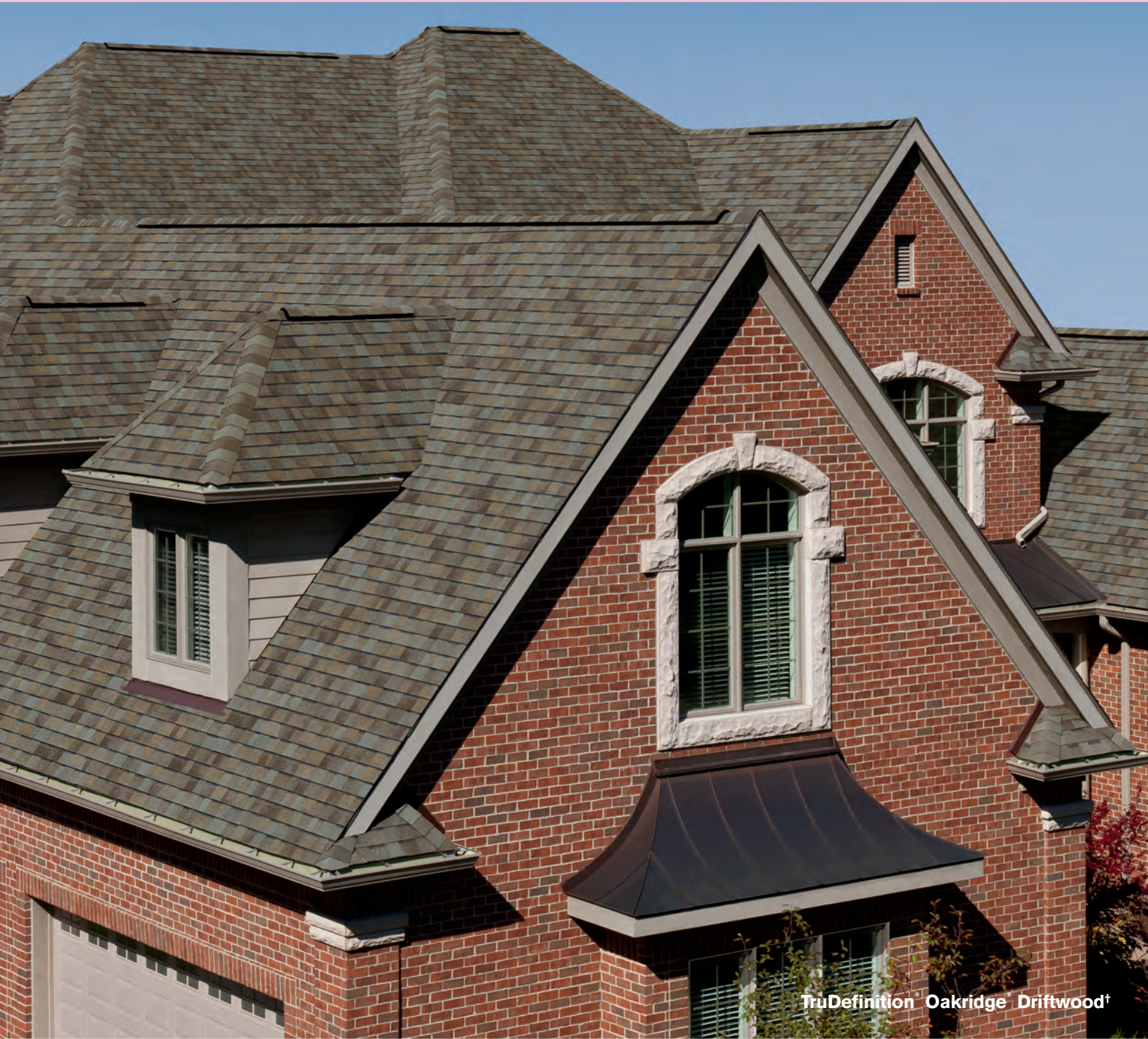
TruDefinition® Oakridge® Driftwood†