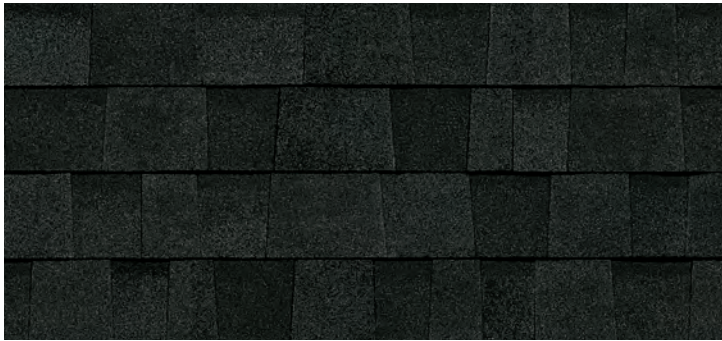
Onyx Black †