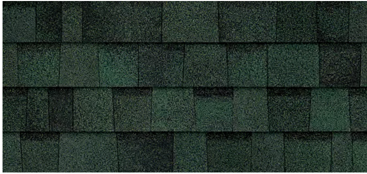
Chateau Green †